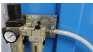
Air Powered so safe for food preparation areas.