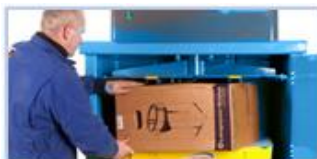
Optimal size fill chamber.