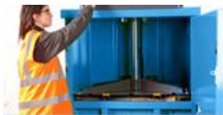
Best compaction ratio means more material in each bale, reducing machine run time