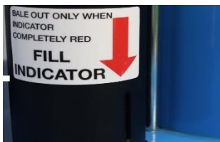
"Bale Full" indicator helps ensure safe operation at multi-user sites